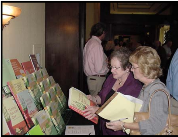
Don't forget to visit our vendors

If it's true that we are here to help others, then what exactly are the others here for?