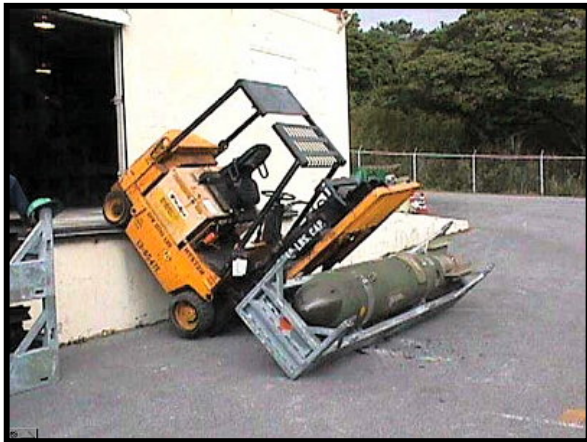
Need Forklift Training?