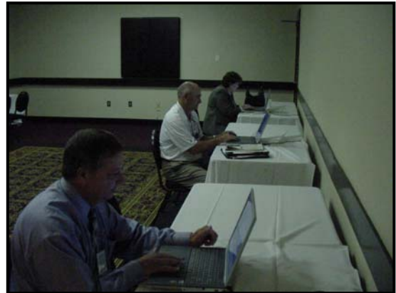
Members taking advantage of the Conference Internet Café'