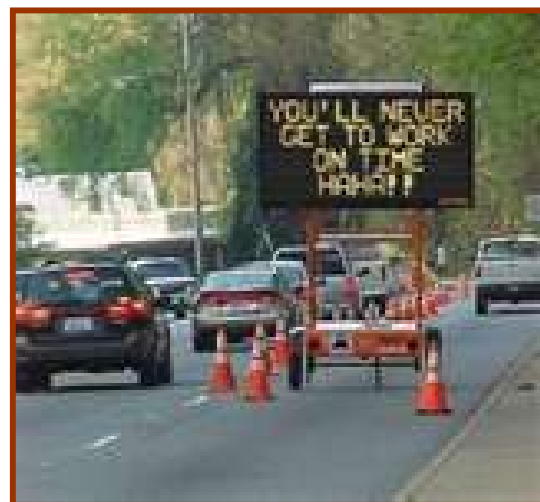
Somewhere on I-40

"If you shoot at mimes, should you use a silencer?" Steven Wright